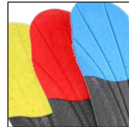
Vario Wide Fit System